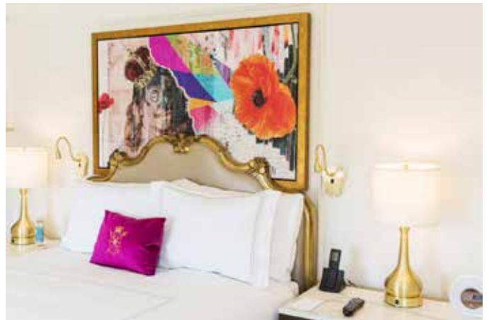
Historic Cavalier Hotel Run-of House $459 per night - (10 rooms available)