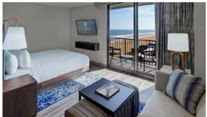
Embassy Suites Run-of House $339 per night - (10 rooms available)