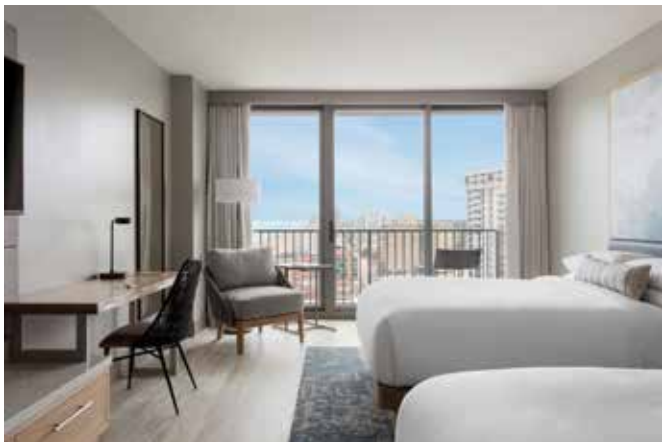
Marriott Virginia Beach Oceanfront Run-of-House $339 per night

The majority of our rooms are located in the MARRIOTT VIRGINIA BEACH OCEANFRONT (host hotel) and where the events will take place.